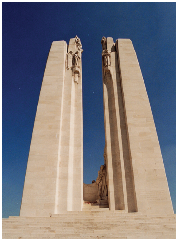
Fig. 1. The Vimy Ridge Memorial

The twin 'pylons', each 67 metres in height, represent the countries of Canada and France (Fig. 1). Twenty sculptured figures on the monument and the names of 11,285 Canadians missing in France are carved on the walls. The monument took ten years to build and was unveiled on 29 July 1936.