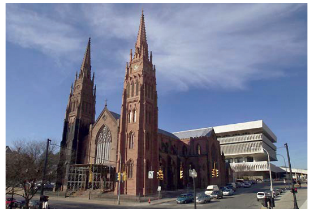
Fig. 4. Albany Cathedral, New York

The Cathedral of the Immaculate Conception, Albany, New York State (USA) was initially constructed between 1848 and 1852 (Fig. 4). The design was by Patrick Charles Keeley and was inspired by Cologne Cathedral. The north spire was constructed in 1862 and the south spire in 1887. The cathedral was completed in 1892 with the construction of the sanctuary and sacristies at the west end. The cathedral is now part of a major urban area and the stonework has decayed – particularly the more exposed stonework in the spires and the clerestory – and by 2000 it was in need of replacement.