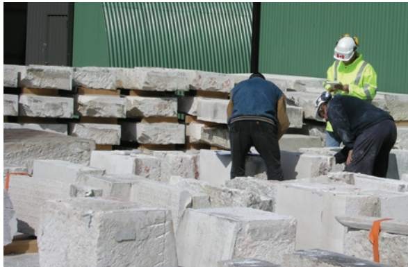
Fig. 2. Matching the stone at Vimy

programme of testing and assessment. The testing programme was developed using failure mode and effect analysis where the likely modes of failure and their consequences are evaluated. The main causes of failure were determined as being related to differential movement between the stone and the sub-structure, which was resulting in stresses within the stone. As a result, it was agreed that physical properties (strength, water absorption and thermal movement) and appearance (colour and texture) needed to be included in the testing programme. A good understanding of the causes of failure was considered essential if future risks of failure were to be minimised.