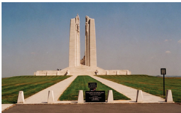
Fig. 3. The Vimy Ridge Memorial restored

Once the testing programme was in place it was necessary to identify currently available stones. The only stone known to be in commercial production was 'Veselje Unito' from the island of Brac, just off the Croatian coast. However, this stone had been used in some earlier restoration work, with disappointing results. The difficulty with finding the original quarry was that its location had not been recorded at the time of the original construction probably in part