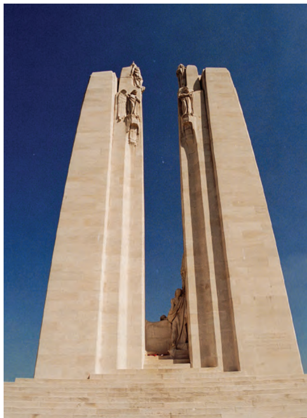
Fig. 1. The Vimy Ridge Memorial

The twin 'pylons', each 67 metres in height, represent the countries of Canada and France (Fig. 1). Twenty sculptured figures on the monument and the names of 11,285 Canadians missing in France are carved on the walls. The monument took ten years to build and was unveiled on 29 July 1936.