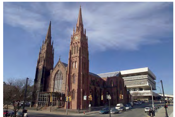
Fig. 4. Albany Cathedral, New York

The Cathedral of the Immaculate Conception, Albany, New York State (USA) was initially constructed between 1848 and 1852 (Fig. 4). The design was by Patrick Charles Keeley and was inspired by Cologne Cathedral. The north spire was constructed in 1862 and the south spire in 1887. The cathedral was completed in 1892 with the construction of the sanctuary and sacristies at the west end. The cathedral is now part of a major urban area and the stonework has decayed – particularly the more exposed stonework in the spires and the clerestory – and by 2000 it was in need of replacement.