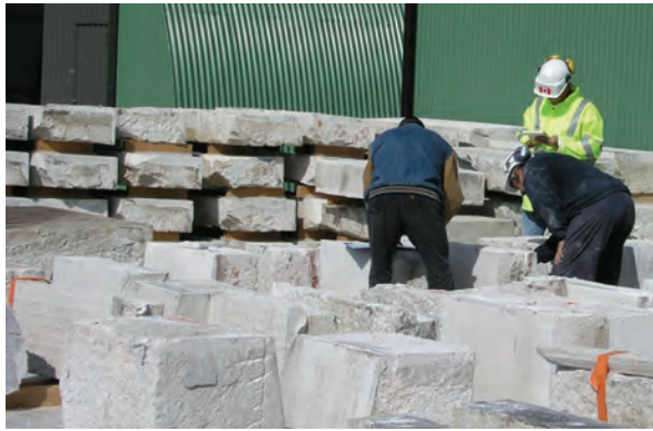
Fig. 2. Matching the stone at Vimy

programme of testing and assessment. The testing programme was developed using failure mode and effect analysis where the likely modes of failure and their consequences are evaluated. The main causes of failure were determined as being related to differential movement between the stone and the sub-structure, which was resulting in stresses within the stone. As a result, it was agreed that physical properties (strength, water absorption and thermal movement) and appearance (colour and texture) needed to be included in the testing programme. A good understanding of the causes of failure was considered essential if future risks of failure were to be minimised.