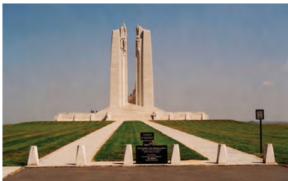
Fig. 3. The Vimy Ridge Memorial restored

Once the testing programme was in place it was necessary to identify currently available stones. The only stone known to be in commercial production was 'Veselje Unito' from the island of Brac, just off the Croatian coast. However, this stone had been used in some earlier restoration work, with disappointing results. The difficulty with finding the original quarry was that its location had not been recorded at the time of the original construction probably in part