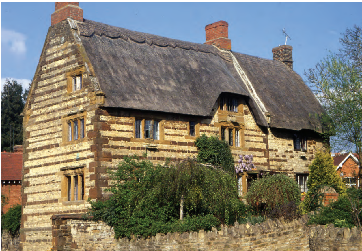
Fig. 2. Stoneacres, a cottage in Blisworth, built of Blisworth Limestone and Northampton Sand ironstone (both local), with mulioned windows of Duston-type sandstone.