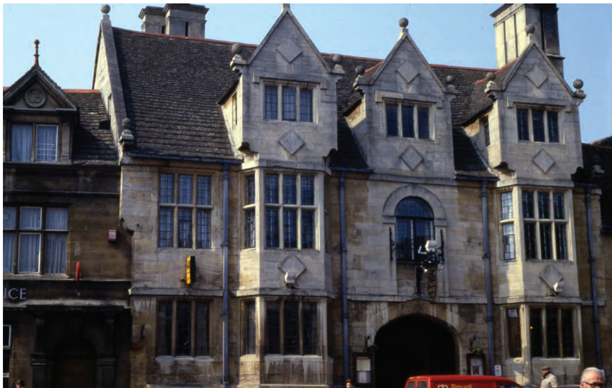
Fig. 1. The Talbot Inn, Oundle (1626): ashlar and mouldings of Weldon Stone, from the Upper Lincolnshire Limestone near Corby.

only in the north, reaching just as far south as Maidwell and almost to Kettering. The Rutland Formation contains a very local white sandstone (at Kingsthorpe), and a thin limestone which thickens southwards and was quarried as Helmdon Stone. The Blisworth Limestone is the chief local building stone of the eastern side of the county (and partly hidden by boulder clay) from Brackley in the south to beyond Oundle in the north; it was a source of freestone at Cosgrove, Stanwick and Oundle. The Table lists many of the types of stone obtained in Northamptonshire from these geological formations.